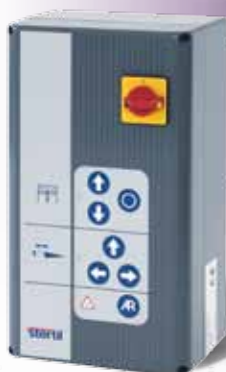
Advanced control box

*** Maximum lip length of 785 mm, for 1970 mm and 2165 mm platform length