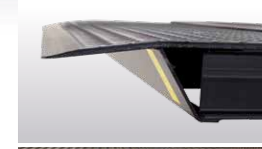
Lip angle is 5.5 degrees as standard