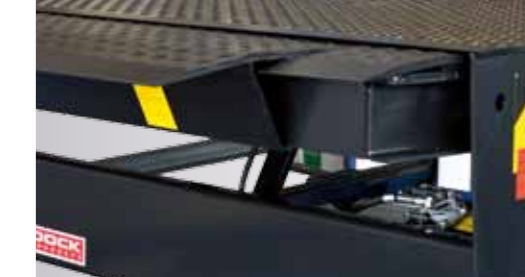
Side sections in the lip make the leveller suitable for both wide and narrow vehicles