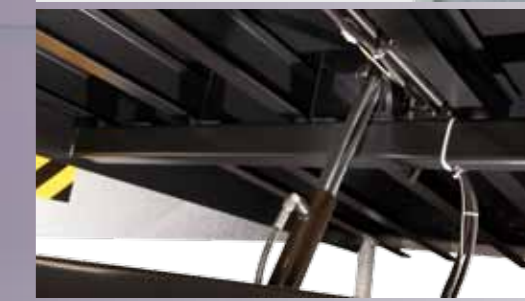
One hydraulic (main) cylinder