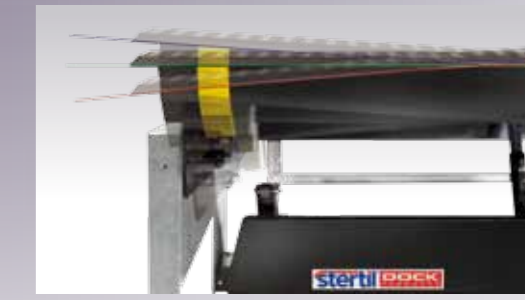
The platform can tilt 125 mm to both sides