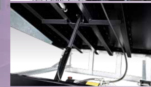
One hydraulic main cylinder