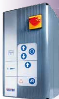
Advanced control box

** Coding F end P represent frame or pit installation. For specific pit details, contact Stertil Dock products*.