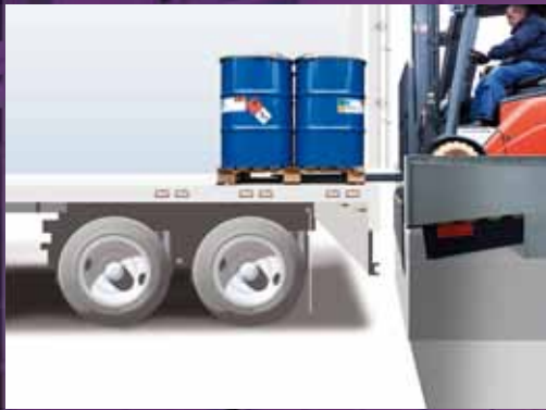
Below Dock Control