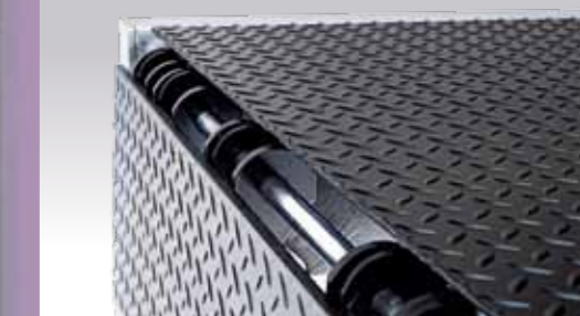
Unique open lip hinge