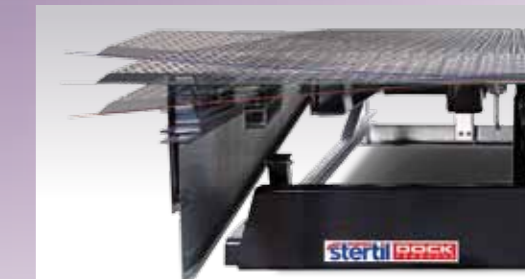
The platform can twist 125mm to both sides