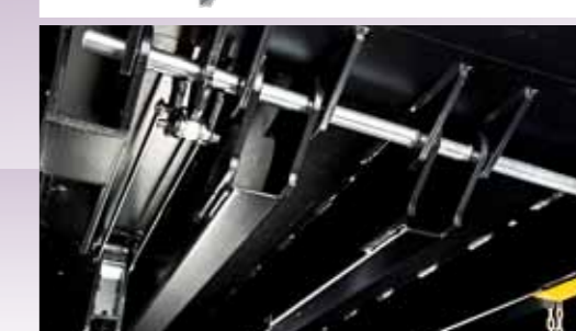
Two safety supports