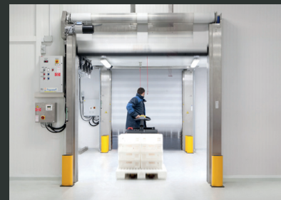
Guidance, hygiene, accident prevention, low-maintenance and protection – A-SAFE's multi-functional Bollards in action