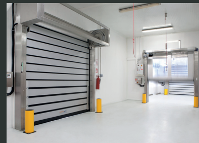
High-speed doors offer energy savings over a long period – but they are expensive and should be protected