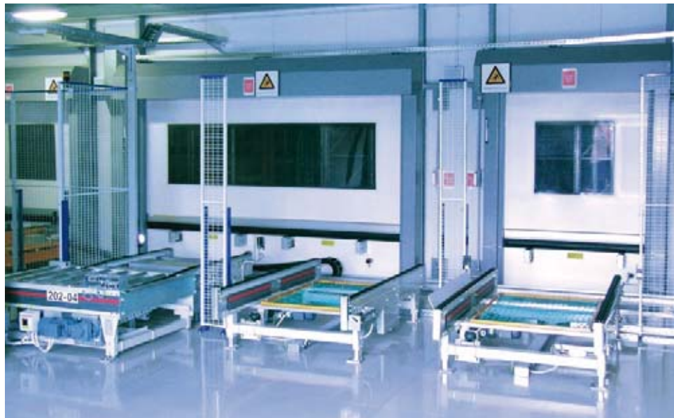
EFA-SRT®-CR in a material lock